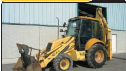
00-TS New Holland NH95, 7575 hours, €25,000 + VAT