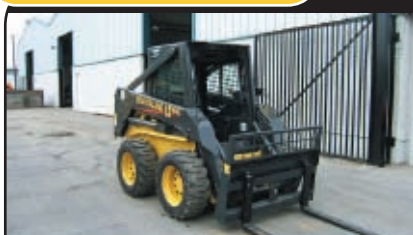
2004 New Holland LS160, 2377 hours, €14,500 + VAT