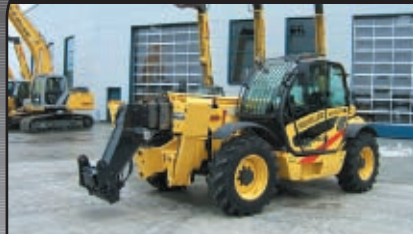
04-C New Holland LM1740, 3583 hours, €43,000 + VAT