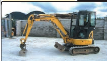
2006 Komatsu PC27MK-2, 200 hours, €24,000 + VAT