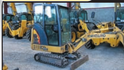
2002 New Holland EC15, 1700 hours, €12,000 + VAT