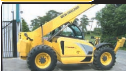
06-C New Holland LM1445, 1394 hours, €50,000 + VAT