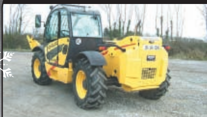
05-LK New Holland LM1440, 2150 hours, €40,000 + VAT