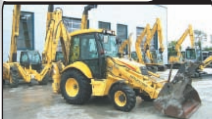
05-C New Holland LB110b, 5680 hours, €36,000 + VAT