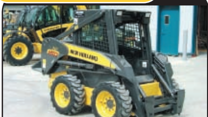
2005 New Holland LS160, 1042 hours, €15,500 + VAT