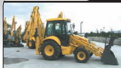
04-KY New Holland LB110b, 5450 hours, €35,000 + VAT