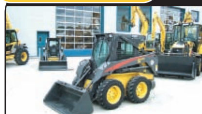
03-LK New Holland LS140, 1301 hours, €12,000 + VAT