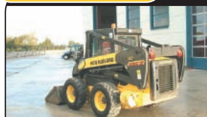
2007 New Holland LS185, 220 hours, €24,000 + VAT