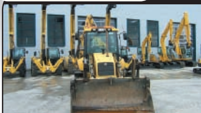
05-LK New Holland LB110b, 4600 hours, €38,000 + VAT