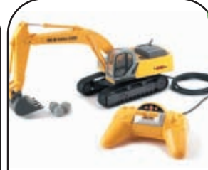
REMOTE CONTROL EXCAVATOR - €45