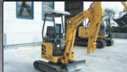
2007 New Holland E18, DEMO MODEL, €15,000 + VAT