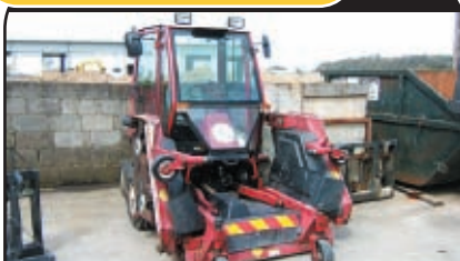
02-LK Toro 455D, 2346 hours, €5,000 + VAT