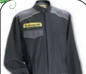
NEW HOLLAND OVERALLS - €35