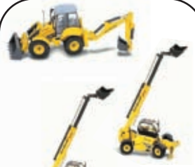
DIE-CAST TOYS - €30 (Diggers & Telehandlers)