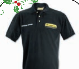
'OFFICIAL PILOT' T-SHIRT - €25