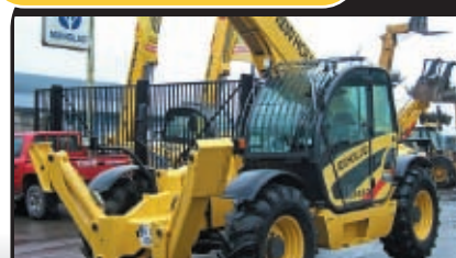
06-C New Holland LM1440, 1806 hours, €45,000 + VAT