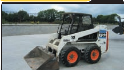
2001 Bobcat 763, 1915 hours, €12,500 + VAT