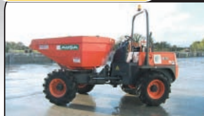
07-TN Ausar D600APG, 199 hours, €19,500 + VAT