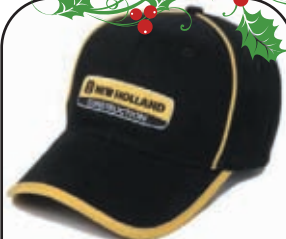
BASEBALL CAP - €5

Adare Machinery has a great selection of Christmas Gifts on offer, all inclusive of VAT.